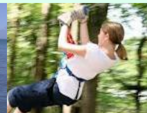
Sharing sports with the foreign students

These programmes provide the Irish students with the unique opportunity to boost their confidence and refine their pronunciation, interacting with small groups of native speakers in a relaxed, friendly and fun environment.